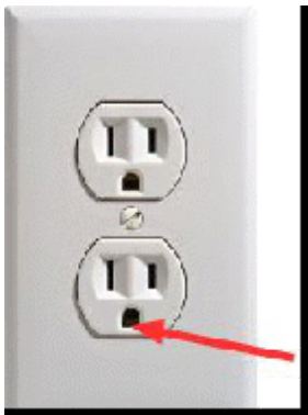
Figure 1. Ground a wire to the bottom hole in a 3-prong outlet. Use some tape to hold it in place. One method is to stick the loose end under the elastic in your underwear, or connect the ground to a piece of aluminum foil that is touching your bare skin.

It may be helpful to ground your body using the grounding in your outlets. CAUTION: Be certain you are placing the ground wire into the bottom hole, in a 3-prong outlet.