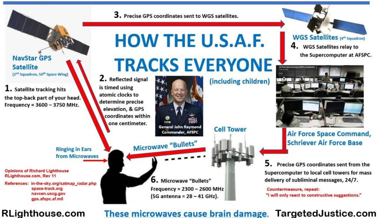
Figure 3. "How the USAF Tracks Everyone." Note the cell tower in item (5) – this is how AT&T and other cell phone companies participate in the tracking and targeting of U.S. civilians.

Cup your hand over one ear, while in a quiet room. Hold it for 60 seconds. You will hear the microwave "pops" coming from cell towers – directed at your head.