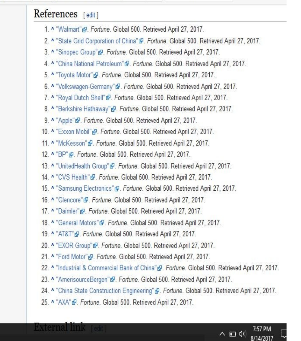
Figure 7. Fortune magazine is the sole reference for wikipedia's opinion of the largest corporations in the world.

According to Forbes, "We quality-check the downloaded financial data to the best of our ability using other data sources, including Bloomberg and available company financial statements." Apparently, the "best of our ability" excludes the truth. They are not even close... That should inform you who controls Forbes magazine. Bloomberg does not even mention Ferrovia-Centro Atlantica SA at $147 trillion USD.